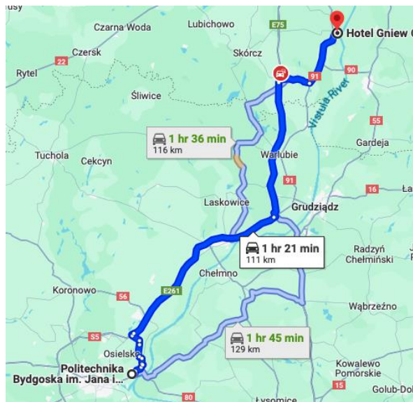
journey by bus